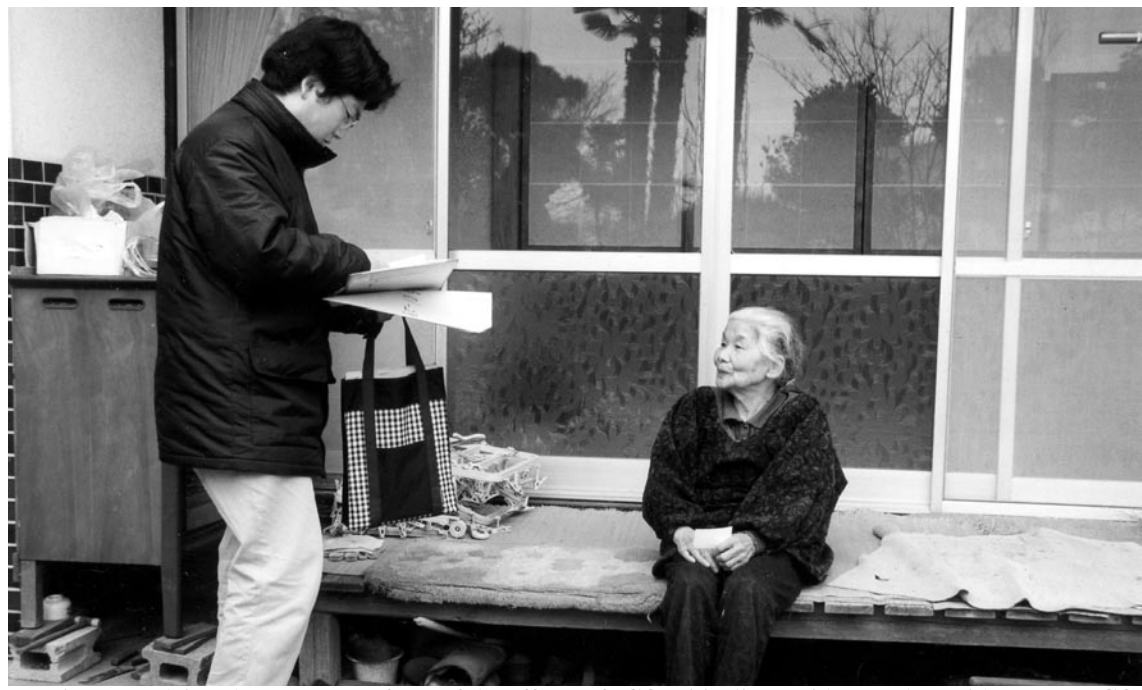
A survey assistant explains about a survey form of the effects of JCO criticality accident to the residents near JCO Co. on February 2002 (Naka-town, Ibaraki Prefecture.)

Three years have passed since the JCO criticality accident occurred on 30 September 1999. This article reviews results of the second field survey of Tokai-mura (Tokai Village) and Naka-machi (Naka Town) residents, carried out by the JCO Criticality Accident Comprehensive Assessment Committee in February 2002, and summarizes the current status of trials concerning the JCO criticality accident that have not been covered since Nuke Info Tokyo 86.