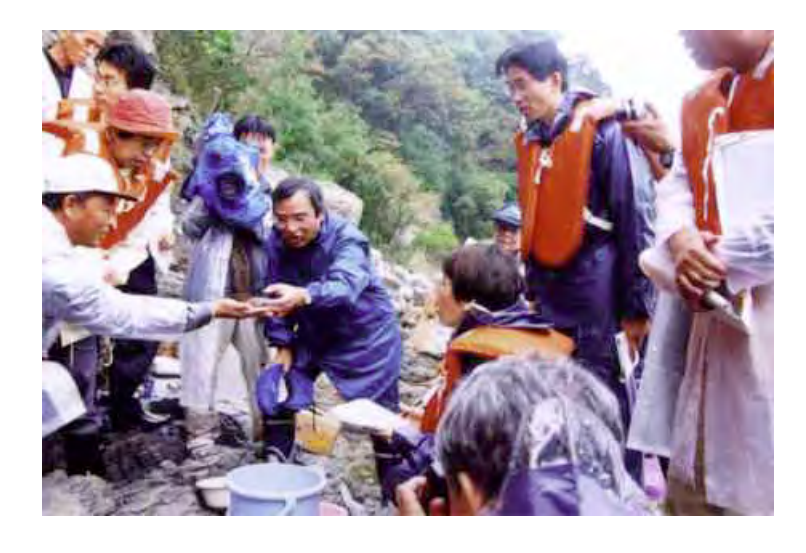
Photo 1. On 8 Oct. 2000, the first underwater study of the area was conducted by scientists belonging to the Ecological Society of Japan. The study was organized by the Association for the Preservation of Nagashima's Nature (see pp. 13-14), and was observed by citizens and five members of the House of Representatives.

From December 1994 to February 1996, during the process of seeking plant construction approval, Chugoku Electric conducted an environmental assessment of the planned site. Subsequently in April 1999, the company submitted an environmental impact assessment report to the former Ministry of International Trade and Industry (now the Ministry of Economy, Trade and Industry, or METI). However, the report made no mention at all of the rare species that live in the vicinity of the planned site (see pp.13-14). It was clear that this assessment was no more than a ritual procedure to make the construction of the plant possible. However, as a result of activities opposing the