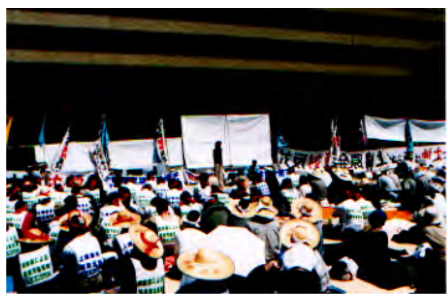
Photo 2. The nation's attention was on Kaminoseki while determined citizens continued their sit-in in front of the Prefectural Office.

Governor agreed to METI applying for the inclusion of Kaminoseki plan in the nation's electricity source basic development plan. We cannot understand why the Governor agreed to METI when he states in his written response that "depending on future performance [by the central government on the attached conditions], [I will] reserve the right to defer cooperation with secretarial work and to exercise other Prefectural rights [such as refusing to give approval to reclaim land]." The governor's response did not make any mention of Iwaishima, and the residents strongly felt that they had been "betrayed" by the Governor. On 12 June,