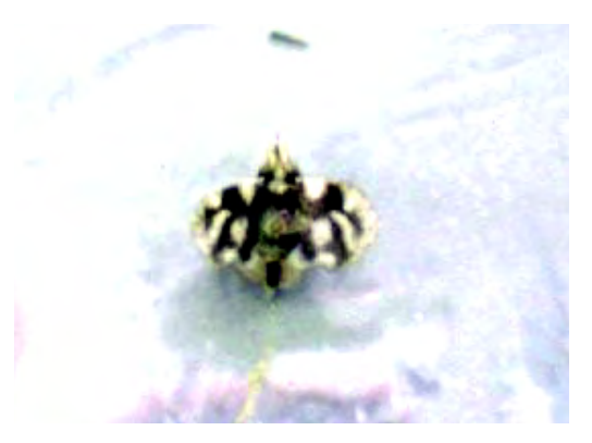
Fig. 5 Amakusaumikochou (Gastropteron bicornutum)

in the whole of Japan (Fig. 3). Peregrine Falcons nest and breed in this area.