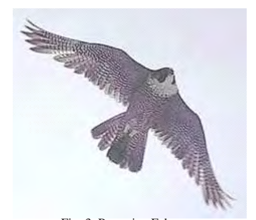
Fig. 3 Peregrine Falcons (Falco peregrinus, Hayabusa in Japanese)