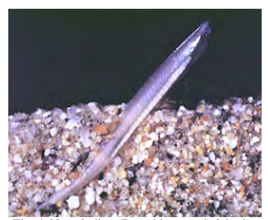
Fig. 4 Namekujiuo (Branchiostoma belcheri)