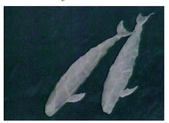
Fig. 2 Sunameri (Neophocaena phocaenoides)