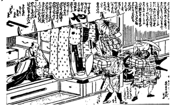
Fig. 2 A drawing of a recycled KIMONO shop in Edo-period. From Oedo Energy Situation, Eisuke Ishikawa, 1993, Kodansha Publisher

Japan has become a huge energy consumption nation. However, Japanese people have been very energy conservation minded for a long time. For instance, in the Edo era (1603-1867) clothes were recycled (see fig. 2) and there was even a kind of business that collected small bits of used candles for reuse. People used to live without harming their environment. But now we are trying to satisfy our desires without considering environmental consequences. Our way of life has been based on producing excessive waste and consequently harming the ecosystem.