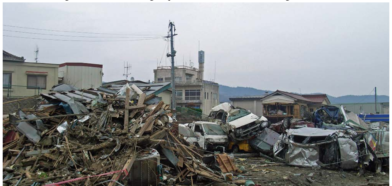
Photograph of disaster waste in Kesennuma City, Miyagi Prefecture, on May 1, 2011

The Tokyo area has also seen incidents of radioactive waste occurring in normal waste and in incinerated ash in sewage mud, and this waste material is being stored.