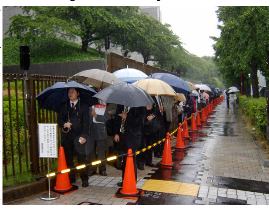
Waiting for the verdict

Interestingly, within two weeks of the Supreme Court decision newspaper reports suggested that Monju was not the top priority project in Japan's nuclear development strategy. An article in the Asahi Shimbun, a leading daily national newspaper, included the following claim: "In a policy shift, the government will upgrade existing light-water nuclear reactors and shelve its fast-breeder reactor plans for the nation's power needs over the next few decades, officials said Thursday." (11 June 2005) The official quoted was from the Nuclear Energy Policy Planning Division of